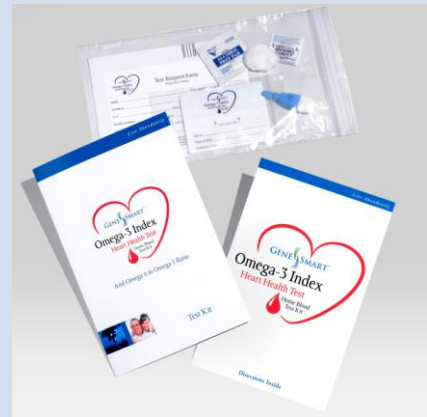
Omega-3 Index Home Test Kit

Purchase Your Gene Smart Omega-3 Index Home Blood Test Kit Today!