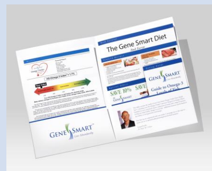
Results Folder - Inside